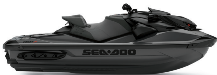
● Premium Triple Black