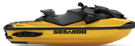
● Millennium Yellow