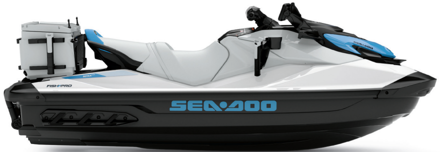
White & Gulfstream Blue