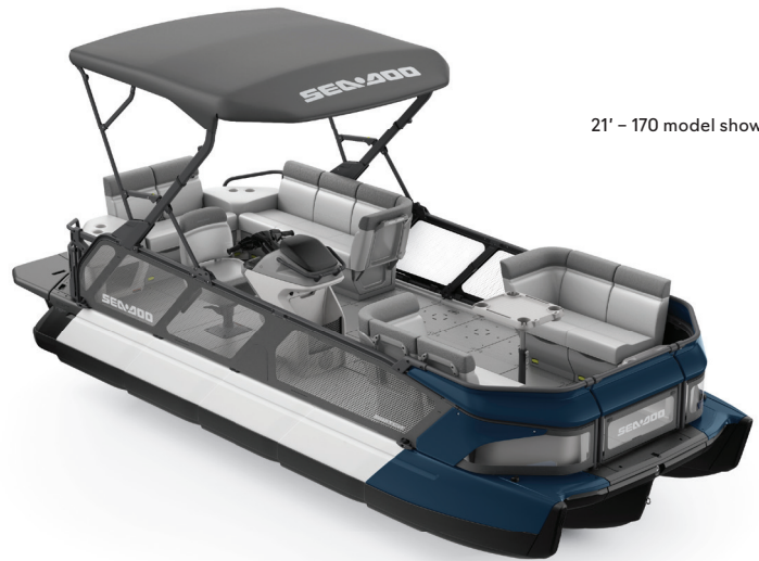
21' - 170 model shown