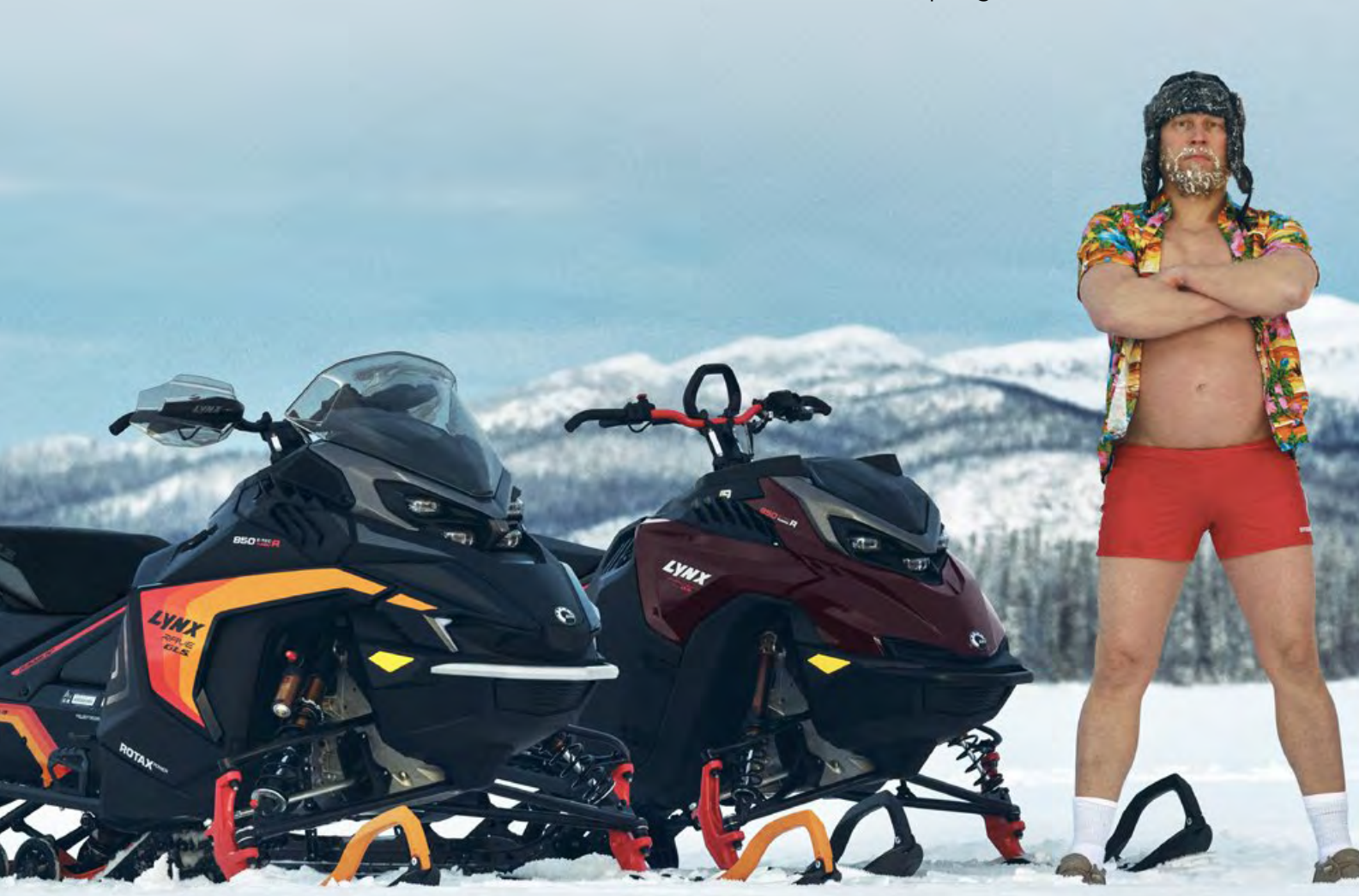
© 2024 BRP Finland Oy. All rights reserved. ®, TM and the BRP logo are trademarks of Bombardier Recreational Products Inc. or its affiliates. *All other trademarks are the property of their respective owners.Because of our ongoing commitment to product quality and innovation, we reserve the right at any time to discontinue or change specifications, prices, designs, features, models or equipment without incurring obligation. Always consult your snowmobile dealer when selecting a snowmobile for your particular needs and carefully read and pay special attention to your Operator's Guide, safety instructions and to the safety labeling on your snowmobile. Always ride responsibly and safely. Always wear appropriate clothing, including a helmet. Always observe applicable local laws and regulations. Don't drink and drive. Units in pictures can be equipped with optional accessories.