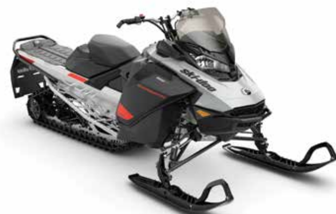
BACKCOUNTRY™ SPORT SHOWN