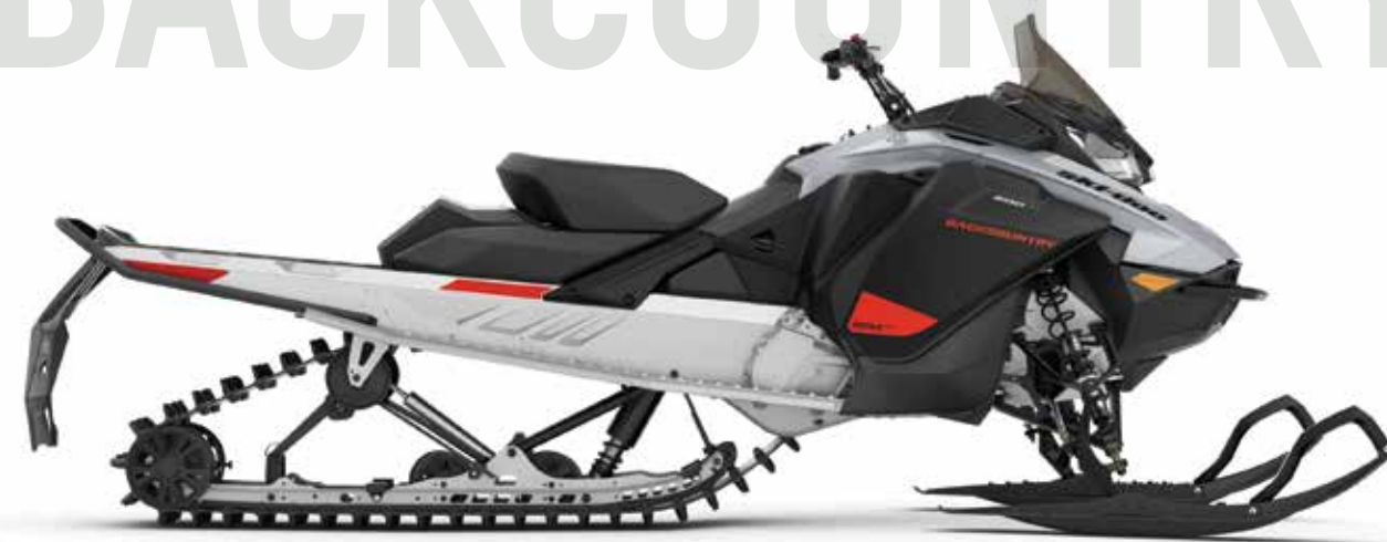
BACKCOUNTRY™ SPORT SHOWN