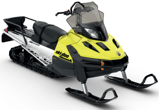
TUNDRA™ LT 600 ACE™ shown