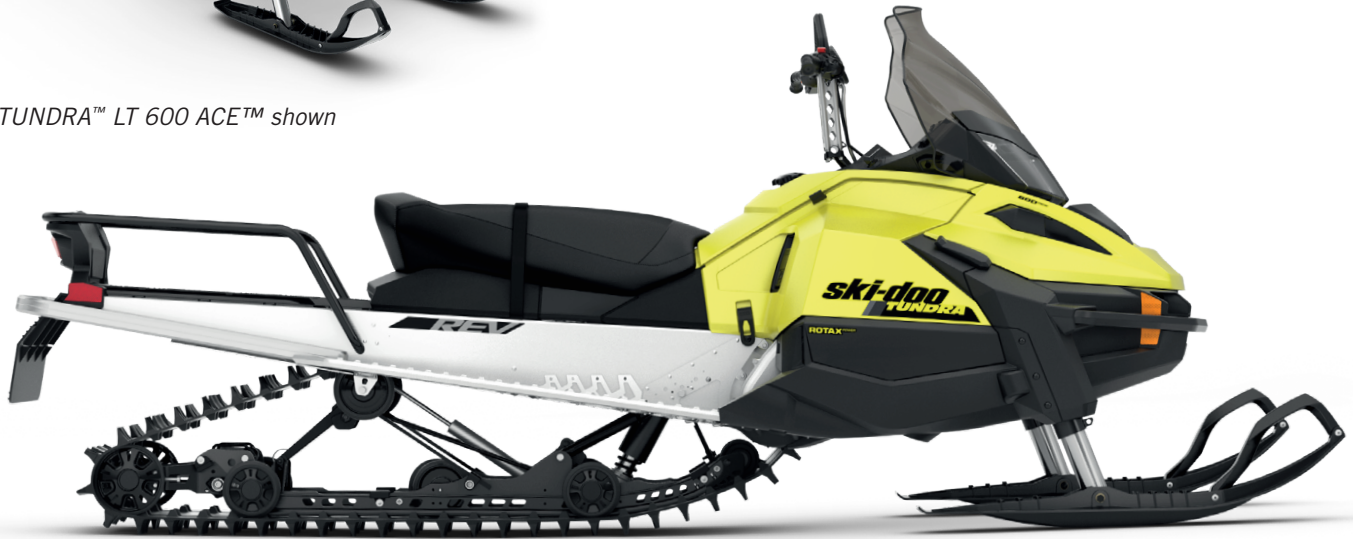
TUNDRA™ LT 600 ACE™ shown