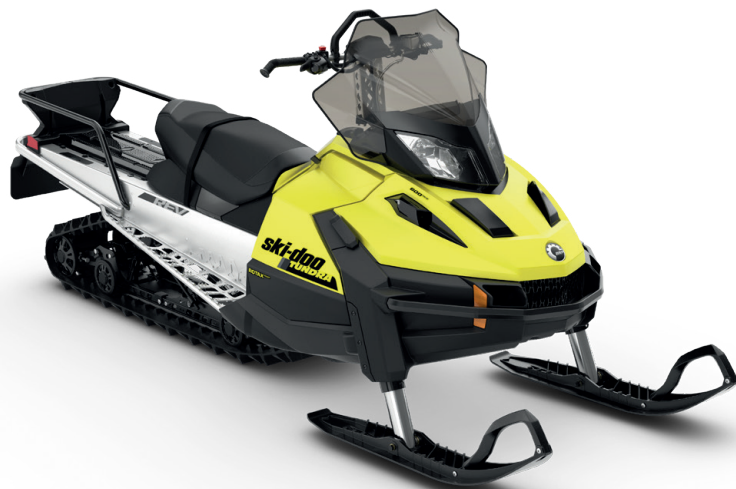
TUNDRA™ LT 600 ACE™ shown