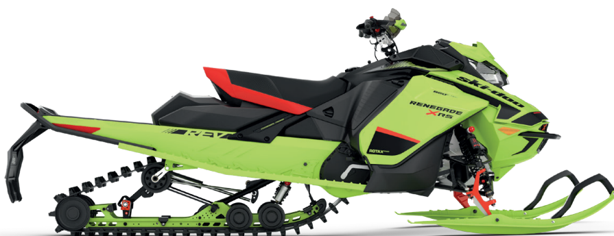
RENEGADE® X-RS® 850 E-TEC® shown