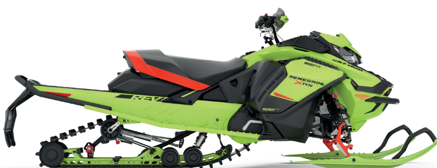
RENEGADE® X-RS® 900 ACE™ TURBO shown