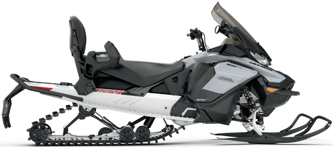
GRAND TOURING SPORT 600 ACE™ shown