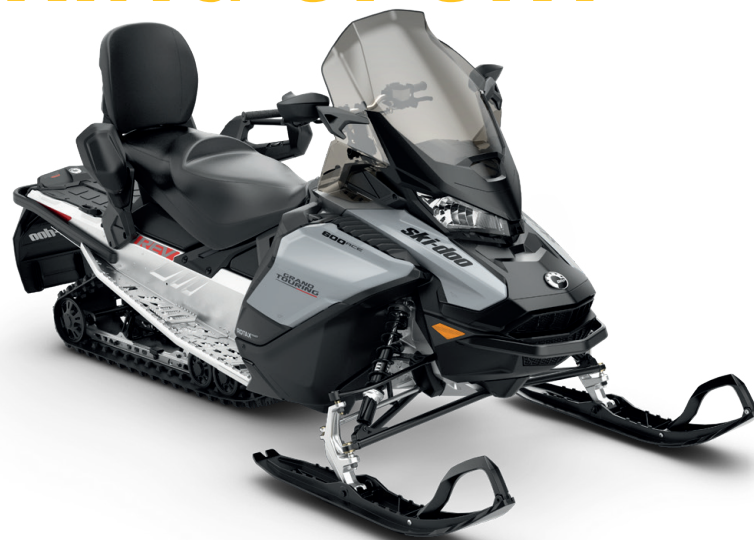
GRAND TOURING SPORT 600 ACE™ shown