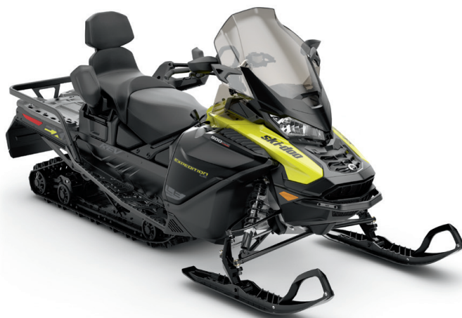
EXPEDITION® LE 900 ACE™ TURBO shown