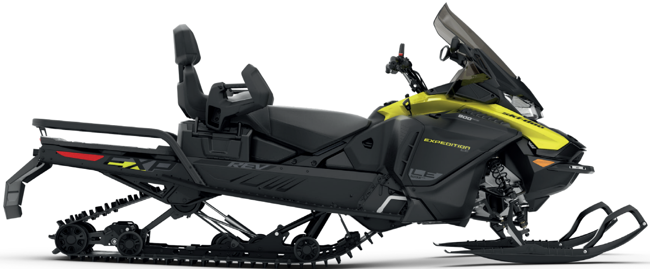
EXPEDITION® LE 900 ACE™ shown