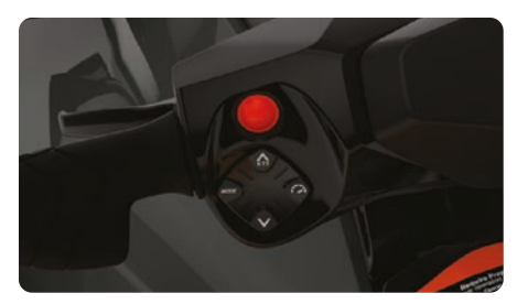
VTS<sup>™</sup> (Variable Trim System) Provides handlebar-activated settings so riders can easily find the ideal trim for varying conditions.