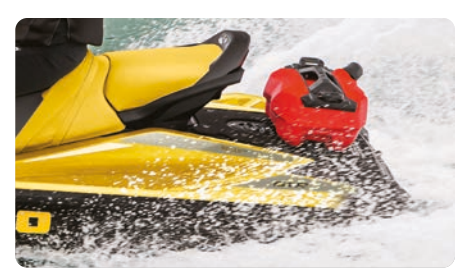
Swim Platform with Integrated LinQ System Exclusive quick-attach system on a large swim platform that allows for easy installation of storage accessories.