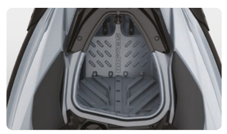
Large Front Storage An impressive 40 gallons of sealed storage space allows riders to safely stow belongings while riding.

This moderate V-shaped hull guarantees a stable, enjoyable ride in variable water conditions. Confident, predictable handling but incredibly playful when you want it to be.