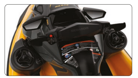
BRP Audio – Premium System (Optional) The industry's first manufacturer-installed truly waterproof Bluetooth<sup>+</sup> audio system.