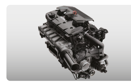
Rotax<sup>®</sup> 1630 ACE<sup>™</sup> - 230 Engine This powerful engine comes standard with a supercharger and external intercooler. It is optimized to run on regular fuel, which lowers fuel costs.