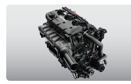
Rotax® 1630 ACE™ – 170 Engine The new Rotax® 1630 ACE™ – 170 is the most powerful naturally aspirated Rotax engine ever on a Sea-Doo® watercraft.