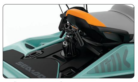
LinQ Retractable Ski Pylon A quick-install retractable ski pylon that stows away when not in use. Features spotter hand grips and rope storage.

Five preset acceleration profiles make it easy to deliver a smooth launch and maintain consistent pace.