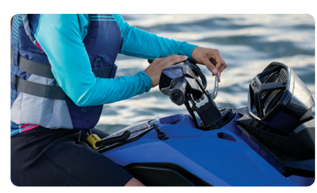
Handlebar With Adjustable Riser A telescopic steering system that optimizes the experience for varying rider sizes.