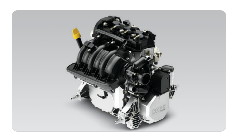
Rotax® 900 ACE™ – 90 Engine The Rotax 900 ACE – 90 gives crisp acceleration with impressive fuel economy.