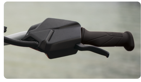
iBR® - Intelligent Brake & Reverse Exclusive to Sea-Doo®, iBR stops the watercraft sooner and provides more control and maneuverability at low speeds and in reverse.

©2022 Bombardier Recreational Products Inc., (BRP). All rights reserved. ®, TM and the BRP logo are trademarks of Bombardier Recreational Products Inc. or its affiliates. All product comparisons, industry and market claims refer to new sit-down PWC with 4-stroke engines. Watercraft performance may vary depending on, among other things, general conditions, ambient temperature, altitude, riding ability and rider/passenger weight. Testing of competitive models done under identical conditions. Because of our ongoing commitment to product quality and innovation, BRP reserves the right at any time to discontinue or change specifications, price, design, features, models, or equipment without incurring any obligation. †Garmin is a trademark of Garmin Ltd. or its subsidiaries.