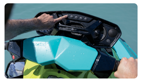
BRP Audio – Portable System (Optional) High-quality waterproof 50-watt Bluetooth<sup>‡</sup> portable sound system.