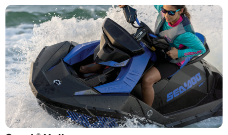
Spark® Hull The Spark hull design provides a lightweight and playful platform. The innovative Polytec™ material further reduces weight while optimizing performance and efficiency. The color-in molding is more scratch-resistant than fiberglass.