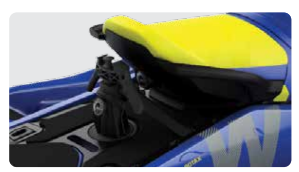
LinQ<sup>™</sup> retractable ski pylon

Five preset acceleration profiles make it easy to deliver a smooth launch and maintain consistent pace.