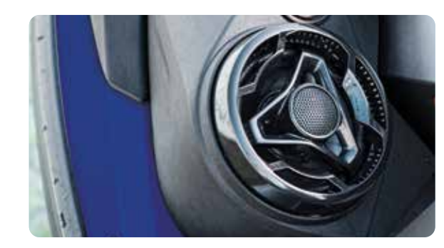
BRP Audio - premium system

Provides easy transport of a wakeboard.1