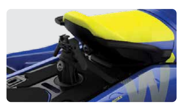
LinQ<sup>™</sup> retractable ski pylon

Five preset acceleration profiles make it easy to deliver a smooth launch and maintain consistent pace.