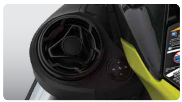
BRP Audio - premium system (optional)

The new Rotax® 1630 ACE™ - 170 is the most powerful naturally aspirated Rotax engine ever on a Sea-Doo watercraft.