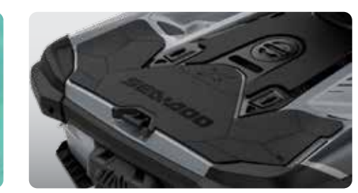
Swim platform with integrated LinQ<sup>™</sup> system

Large front storage area that's easily accessible from a seated position.1