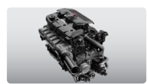
ROTAX® 1630 ACE™ - 300 engine

An industry-first manufacturer-installed truly waterproof Bluetooth<sup>‡</sup> audio system.