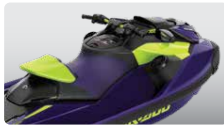
NEW Ergolock™ R system

A narrow seat profile with deep knee pockets and a revolutionary adjustable cockpit that allows riders to lock in to the machine like never before.