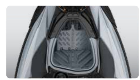
Large front storage

A deep-V design that offers unrivaled handling and acceleration and a new level of control at high speed thanks to it's ingenious "shark gills" feature.