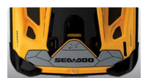
NEW Swim platform with integrated LinQ™ system

A narrow seat profile with deep knee pockets and a revolutionary adjustable cockpit that allows riders to lock in to the machine like never before.