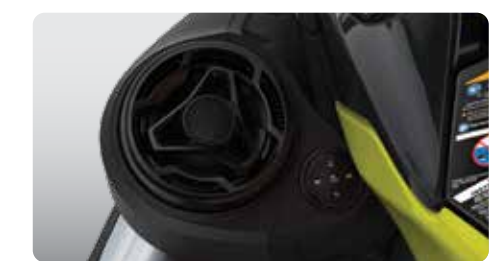
BRP Audio - premium system (optional)

An impressive 143 liters of sealed storage space allows riders to safely stow belongings while riding.