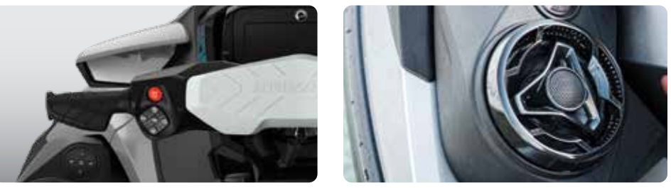
NEW iDF Intelligent Debris Free Pump System (optional: GTX 170 and 230 only) An innovative, industry-first system that allows you to free your pump of weeds and debris with intuitive handlebar-activated controls.