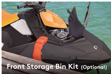
Front Storage Bin Kit (Optional)

Two fuel efficient, compact and lightweight Rotax® engine options.