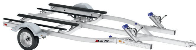
Aluminum MOVE II