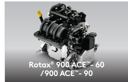
Rotax® 900 ACE™ - 60 /900 ACE™ - 90

Innovative material that reduces weight while optimizing performance and efficiency. The color-in molding is more scratch-resistant than fiberglass.