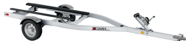
Aluminum MOVE I Extended 1250

©2019 Bombardier Recreational Products Inc., (BRP). All rights reserved. ™, ® and the BRP logo are trademarks of Bombardier Recreational Products Inc. or its affiliates. Products are distributed in the USA by BRP US Inc. All product comparisons, industry and market claims refer to new sit down PWC with 4-stroke engines. Watercraft performance may vary depending on, among other things, general conditions, ambient temperature, and altitude, riding ability and rider/passenger weight. Testing of competitive models done under identical conditions. Because of our ongoing commitment to product quality and innovation, BRP reserves the right at anytime to discontinue or change specifications, price, design, features, models or equipment without incurring any obligation. Printed in Canada. †Bluetooth is a registered trademark owned by Bluetooth SIG, Inc. and any use such marks by BRP is under license.