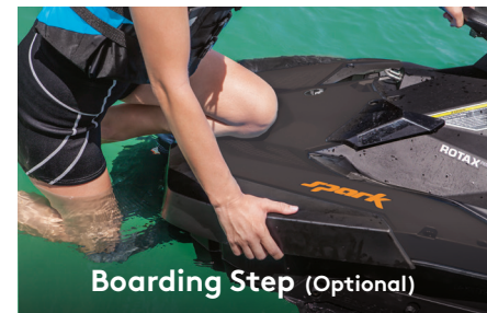
Boarding Step (Optional)

Designed to improve freedom of movement while riding.