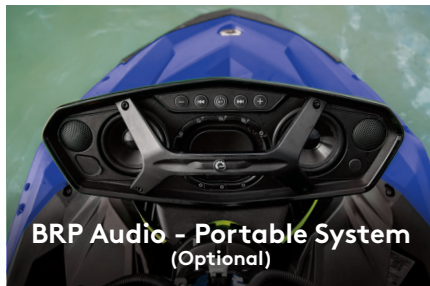
BRP Audio - Portable System (Optional)

High-quality, waterproof 50-watt Bluetooth † portable sound system.