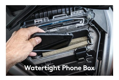
Waterproof and shockproof compartment specifically designed for phone protection.<sup>3</sup>