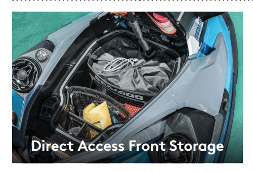
Large front storage area that's easily accessible from a seated position.<sup>1</sup>