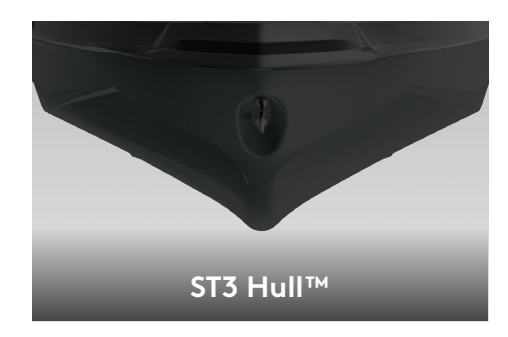
An innovative hull that sets the benchmark for rough water handling, stability, and offshore performance.