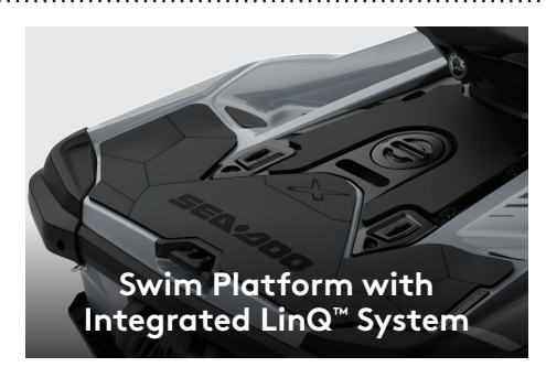
Exclusive quick-attach system on the largest swim platform in the industry that allows for easy installation of accessories.