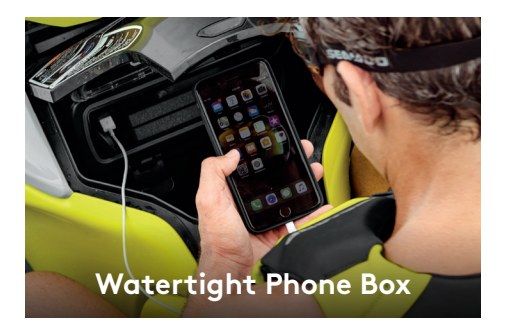
Waterproof and shockproof compartment specifically designed for phone protection.