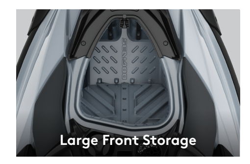
An impressive 40 gallons of sealed storage space allows riders to safely stow belongings while riding.