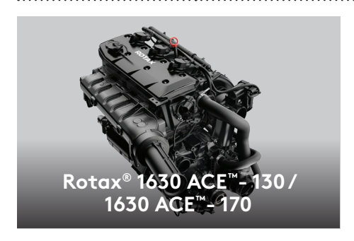
The powerfull 1630 ACE ^{\!\top\!\!\!-} 130 is all about fun and acceleration while the new Rotax ^{\!\otimes} 1630 ACE ^{\!\top\!\!\!-} - 170 is the most powerful naturally aspirated Rotax engine ever on a Sea-Doo watercraft.