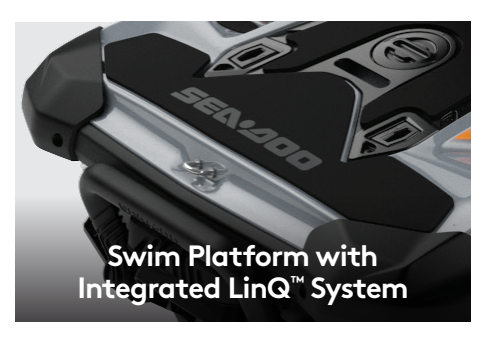
Exclusive quick-attach system on a large swim platform that allows for easy installation of accessories.