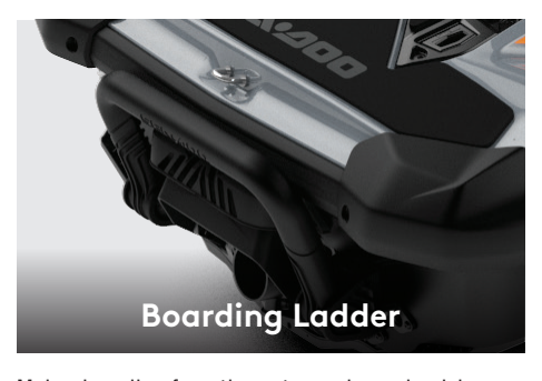
Makes boarding from the water easier and quicker.