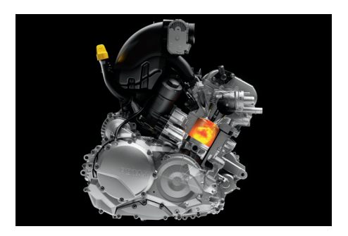
ROTAX 1330 ACE ENGINE

Vehicle Stability System that uses a variety of technologies, including SCS / ABS / TCS, to monitor the vehicle and keep the rider confident on the road.