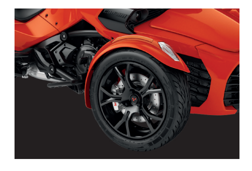
DARK AND CHROME Modern or classic, it's up to you. Choose the trim that best suits your own style and taste.

Large panoramic 7.8" wide LCD color display with BRP Connect" and Audio control keypad, allowing the integration of vehicle-optimized smartphone apps such as media, navigation and many others controlled through the handlebars.