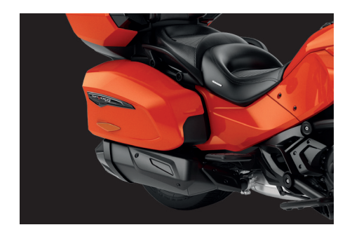
SELF-LEVELING SUSPENSION Rear air shocks automatically adjust to passenger and cargo weight to ensure comfort is never compromised.

UFIT SYSTEM Can be adjusted to fit the rider's height and style in a short period of time.